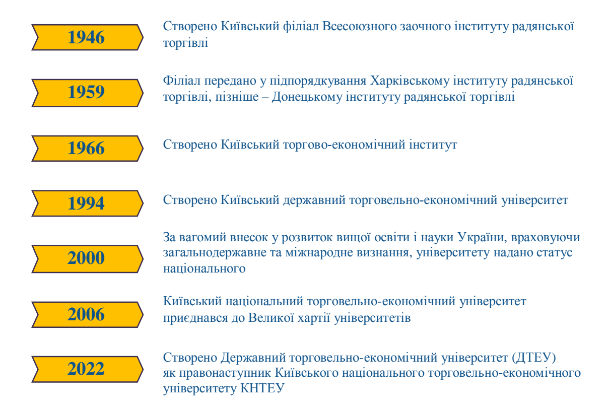
1946 - Kyiv branch of All-Union Correspondence Institute of Soviet Trade was established

State University of Trade and Economics (SUTE) for its history has come a long way of formation and development and is currently recognized by society and the international community as a producer of highly intelligent resources, a powerful innovative educational and scientific complex with modern material and technical base, educational technologies, global information networks.